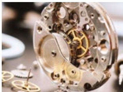
Microparts for watches